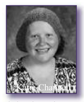
2nd place in Environmental Science -- Marine Reserves: A Photographic Survey to Determine the Efficacy of the Glovers Reef Atoll Marine Reserve (Belize) on Coral Diversity and Abundance ($500 cash)