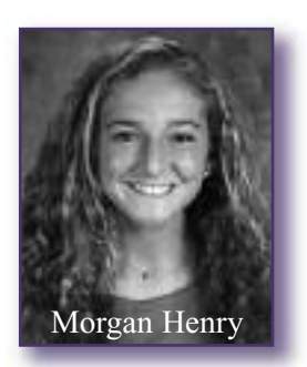
2nd place in Biology The Development of Alternate Planting Methods for Conspecific Crop Species: An Investigation of the Evolutionary Function of Kin Selection on Arabidopsis and Zea Mays ($500 cash)