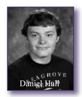
1st place in Environmental Science -- Determining the Effects of Oxidizing Graphene on the Efficiency in a Dye Sensitized Solar Cell ($1,000 cash)