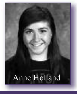
1st place Missouri Coatings Award -- The Development of an Epigallocatechin Gallate Antimicrobial Acrylic Coating for Surface Application (1,500 cash)